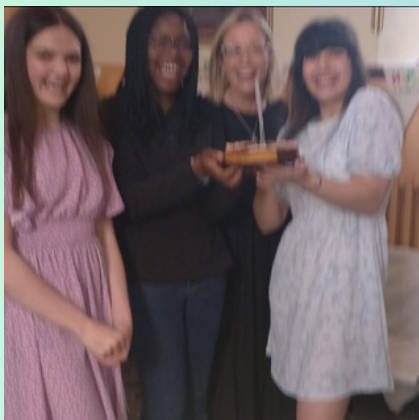
In June the Drogheda Youth Group celebrated its one year birthday. A fantastic evening of celebration was had