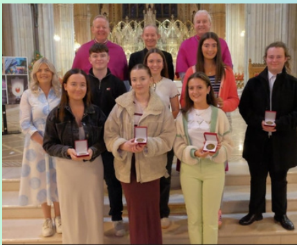
Group of participants from the John Paul I awards