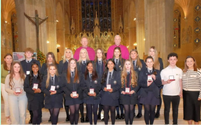
Group of participants from the John Paul I awards

In September we celebrated the St. John Paul II Awards, in Armagh Cathedral. It was a great event, many thanks to all participated in the evening.